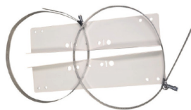
Pole Mount Kit