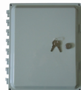
Weather Resistant Key Lock